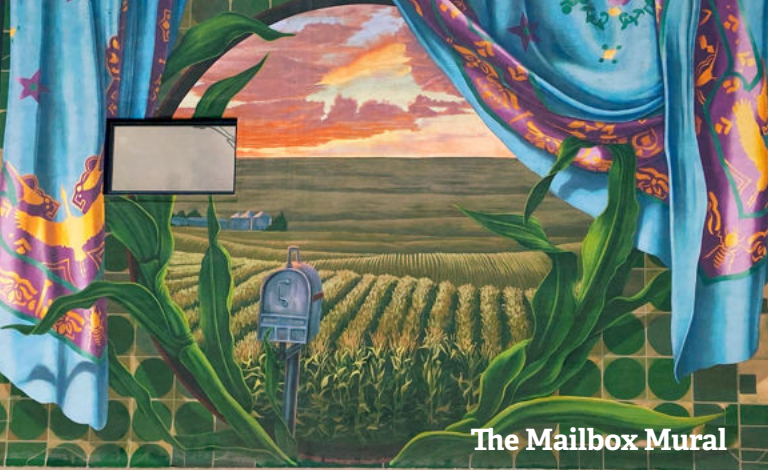
The Mailbox Mural