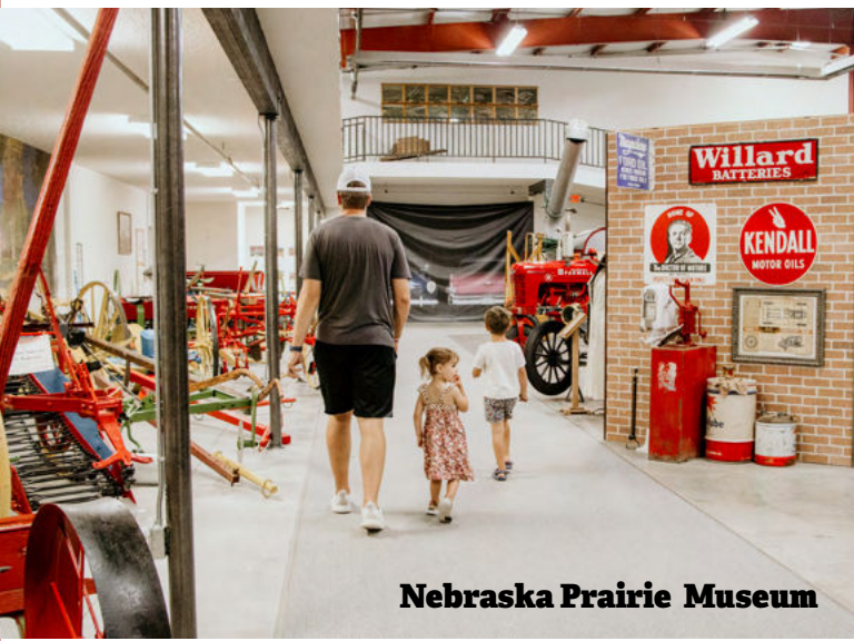
Nebraska Prairie Museum