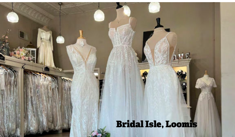
Bridal Isle, Loomis

CROSS DIAMOND MEAT , 522 Minor, Bertrand (308)