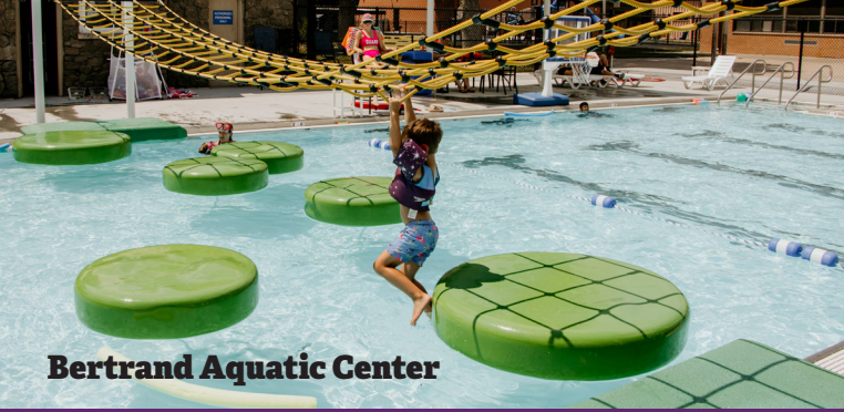
Bertrand Aquatic Center