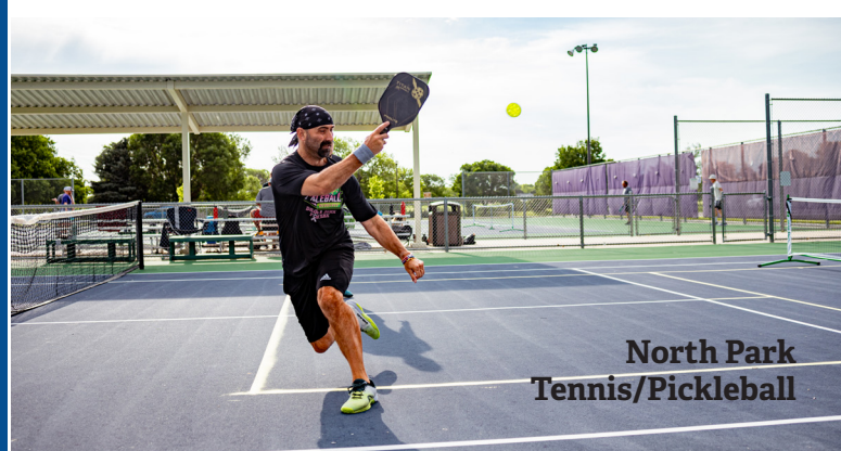
North Park Tennis/Pickleball

1415 Broadway, Holdrege. Indoor pool and walking track, gymnasium, weight room, group classes.