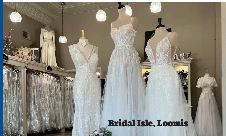
Bridal Isle, Loomis