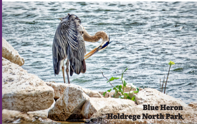
Blue Heron Holdrege North Park