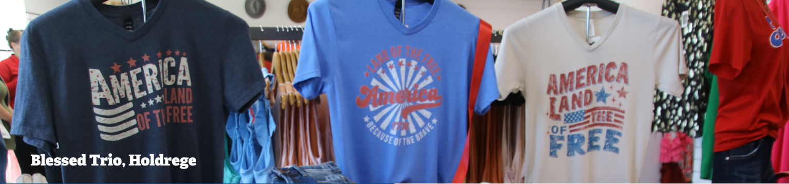
Blessed Trio, Holdrege